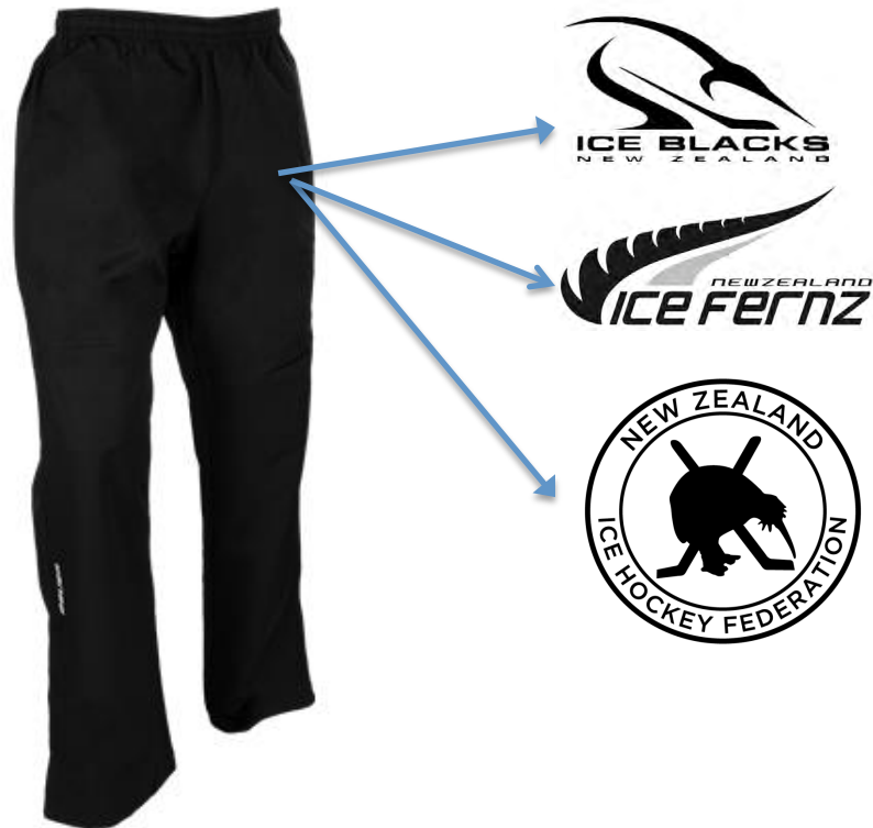
Bauer Track Pants