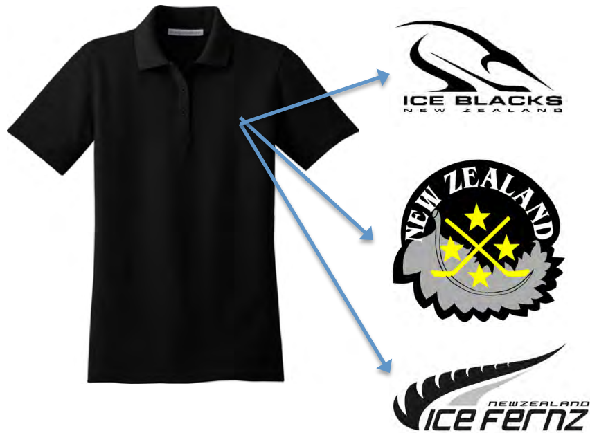
Black Polo Top