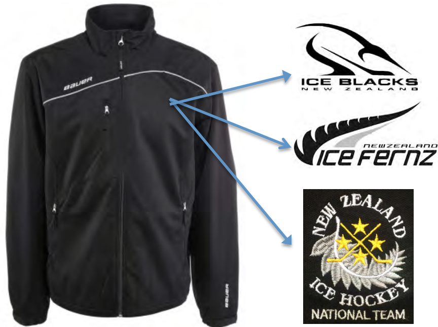
Lightweight Bauer Jacket