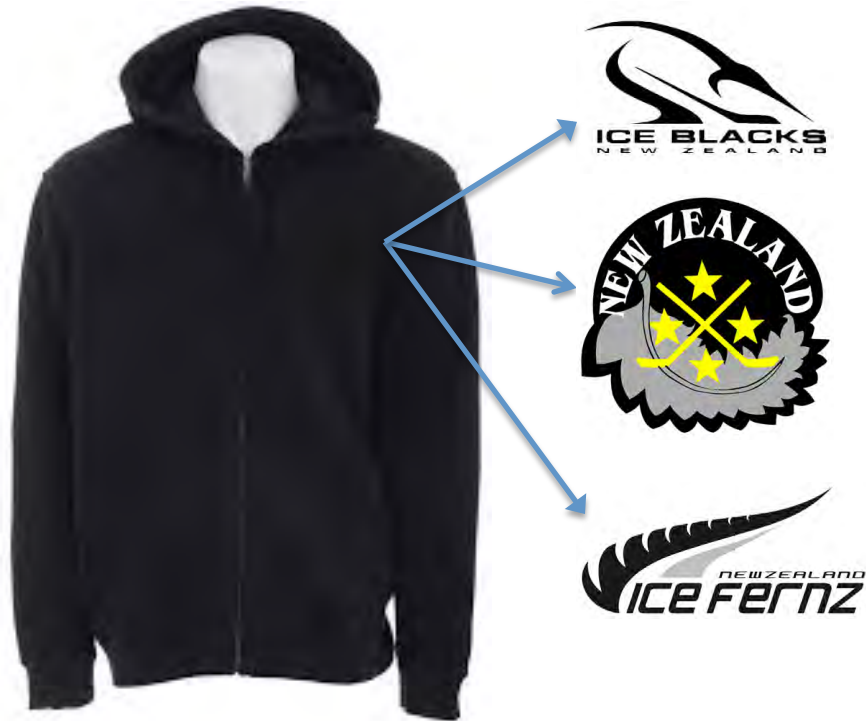
Zippered Black Hoodie