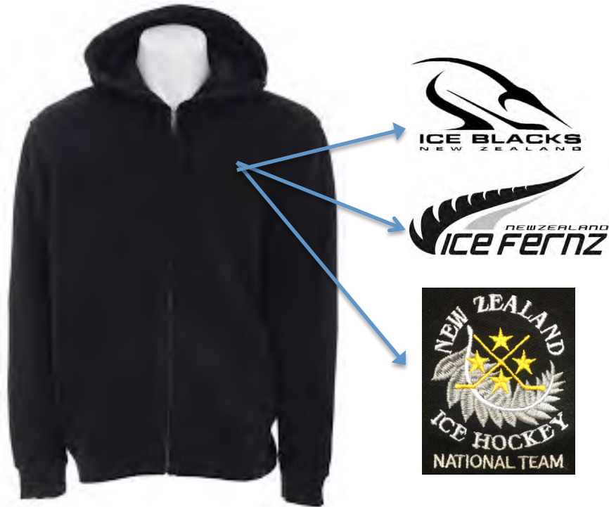
Zippered Black Hoodie